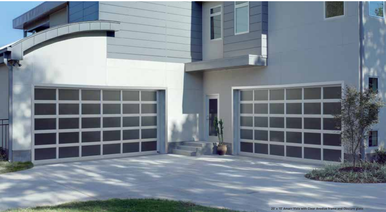
20' x 10' Amarr Vista with Clear Anodize frame and Obscure glass

It's the perfect reflection of your style. The modern industrial look goes residential with the introduction of the Amarr Vista collection. From the outside, these sleek doors perfectly mirror the clean lines and glass expanses of your home's contemporary design. Inside, they transform your garage into a bright and inviting room.